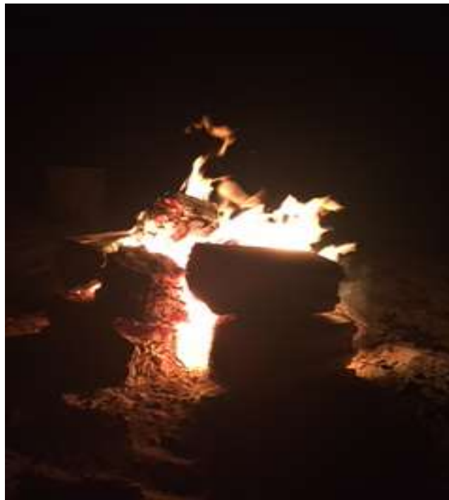
Our fire on the beach on a beautiful starry night.

What a treat it was to arrive at Quaaout/Talking Rock to see soft colours of the evening reflected in Little Shuswap Lake. I'm grateful for the opportunity to have learned & shared with fellow PSCA members for 3 days on beautiful Secwepmc Territory. As always at PSCA conferences, the connections and conversations were a highlight. We enjoyed an abundance of food together, including salmon baked in clay to be smashed with wooden mallets. Of course, Cliff's jokes were slipped into the event at every possible occasion, and I heard he was successful in the games night up in the hospitality suite! Tuesday evening after the sun faded, we gathered on the beach for a fire to continue chatting and sharing stories; stories having been the theme of the day focused on Narrative Therapy. I thank the organizers from TRU for their generosity of time, energy and local treats, and for providing us with the opportunity to build our community while exploring possibilities for indigenization on our campuses. I look forward to next year's conference in North Vancouver!